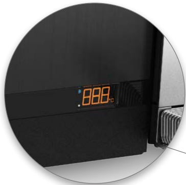
Adjustable fridge temperature