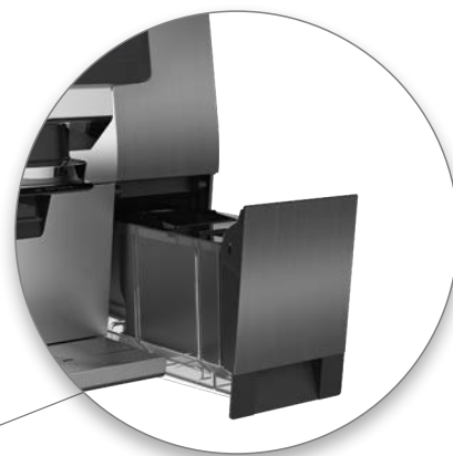
5L Watertank (Special config)